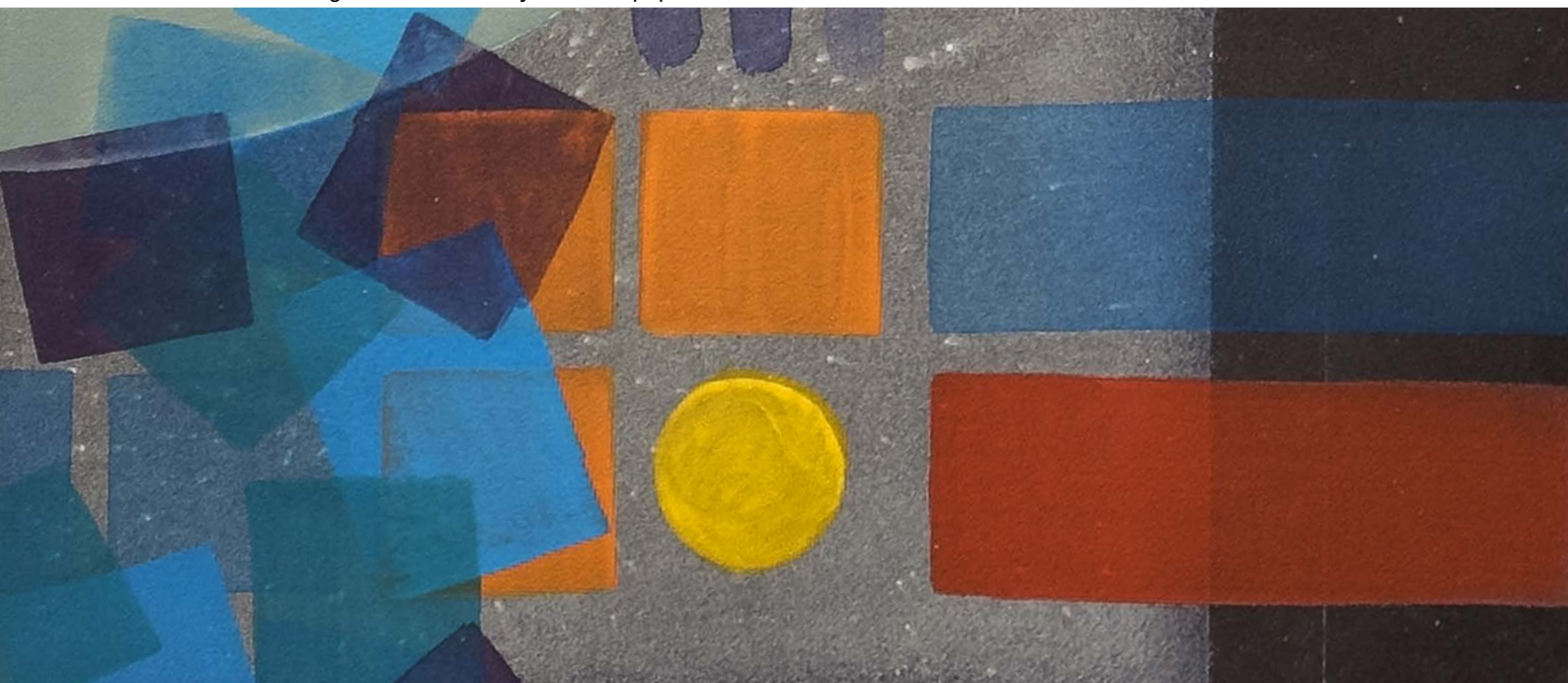
RENÉ MAYER, Long Road , 2012, Acrylic on sandpaper, 180 x 180 cm - Detail

Atelier Roshi Haldenstrasse • Entrance H18 - UG 6340 Baar • Switzerland Doors: 18:00 / Lecture: 18:30